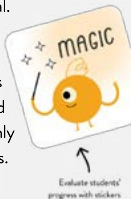
Evaluate students' progress with stickers

We look forward to meeting schools that prioritise modern pedagogy and content creators who seek thoroughly customisable generative AI solutions.